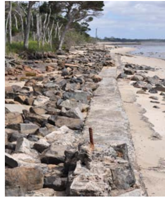
Malcolm Drive seawall ruins

committee. The study was undertaken by a private consulting firm to garner information about sand and tide movement in the area to facilitate actions to remove the seawall ruins on the Malcolm Drive foreshore while mitigating inundation and erosion at this site. The final recommendations will be included in our next newsletter.