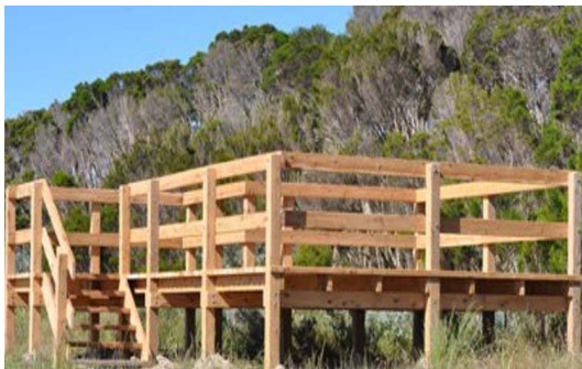
Photo: Completed Pioneer Bay boardwalk viewing platform