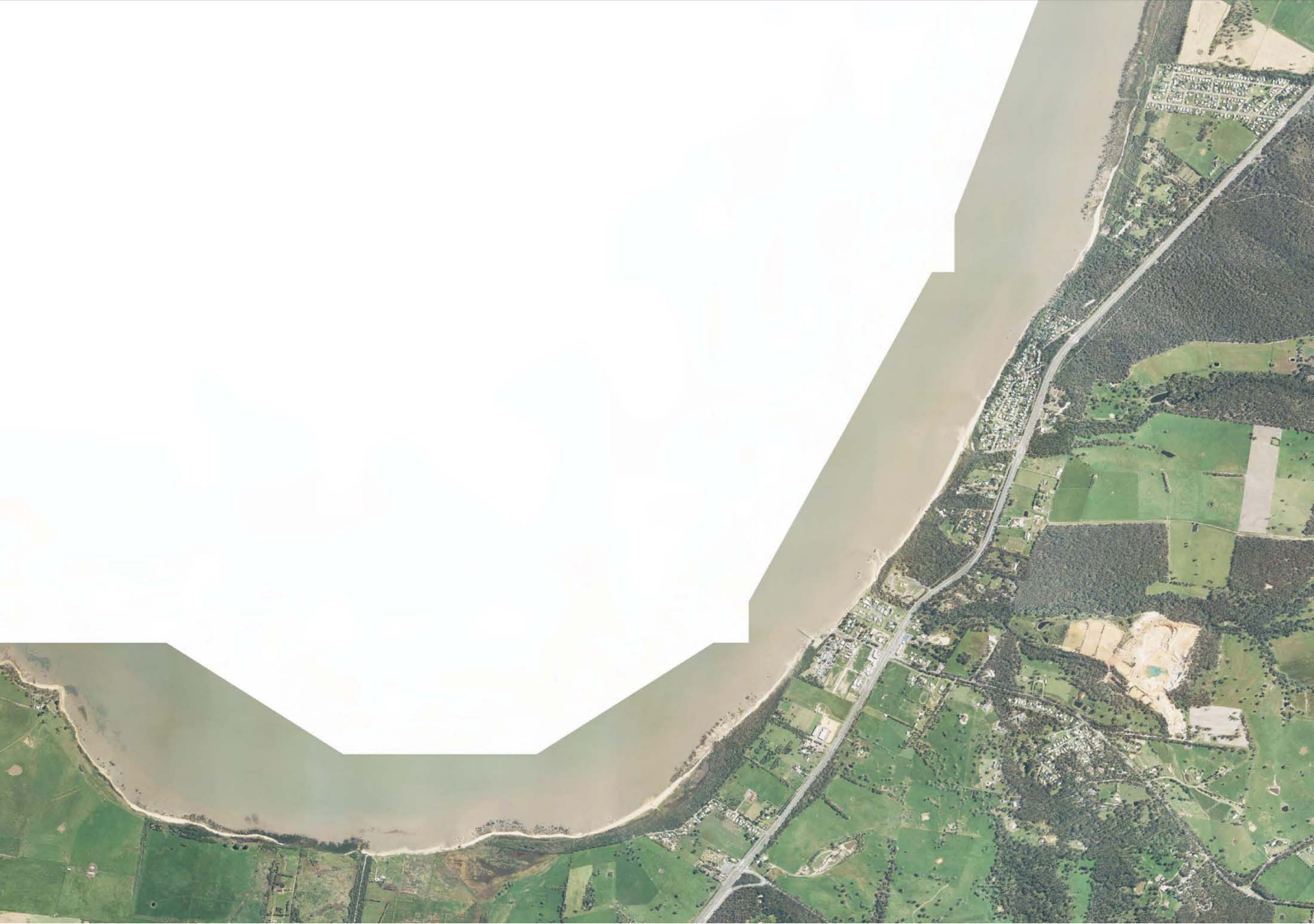
Map provided by Bass Coast Shire