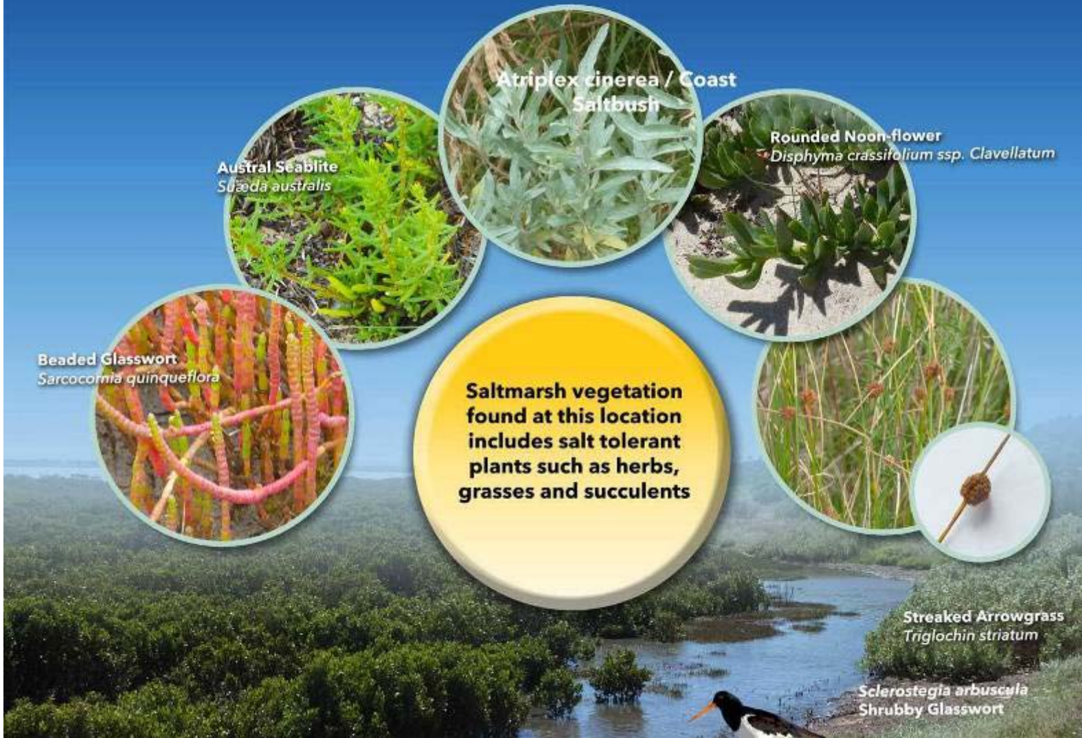
Sclerostegia arbuscula Shrubby Glasswort